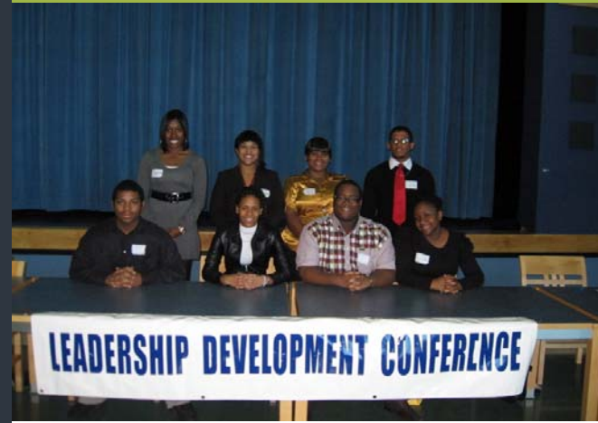
2009-2010 Citywide Officers.