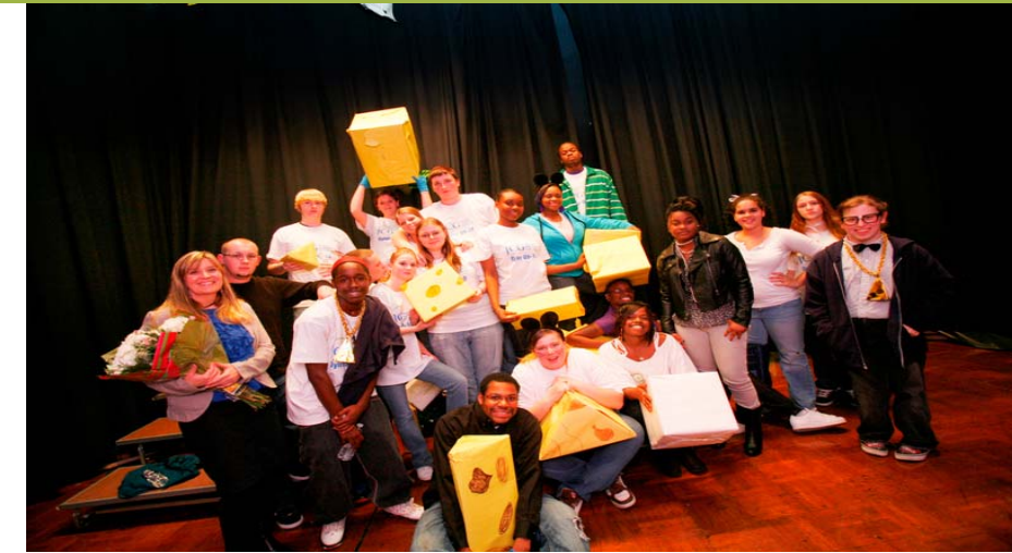
Oylers students reproduction of 'Who Moved My Cheese?'