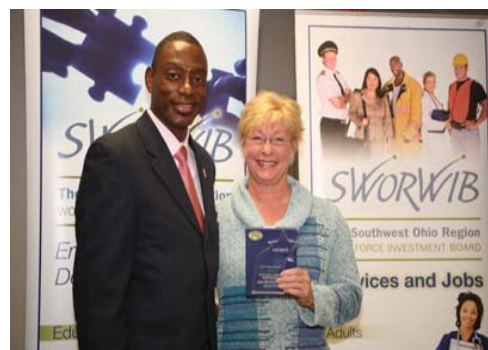
2010 Super American Recovery and Reinvestment Act Summer Youth Provider from the SWORWIB presented by Mayor Mark Mallory.

Jobs for Cincinnati Graduates 7162 Reading Road, Suite 1100 Cincinnati, OH 45237 (513) 631-4400 www.jobsforcincinnati.org